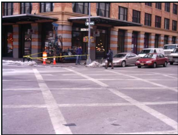
On site Groundwater treatment in New York City

At one site in New York City, Ground water below a building at a busy intersection showed free product. It was not possible to remove the free product by other available products/technology. After discussions with NY DEC, it was decided to inject HydroRemed directly in the ground water. Five injection wells were installed for injection of ground water as seen below.